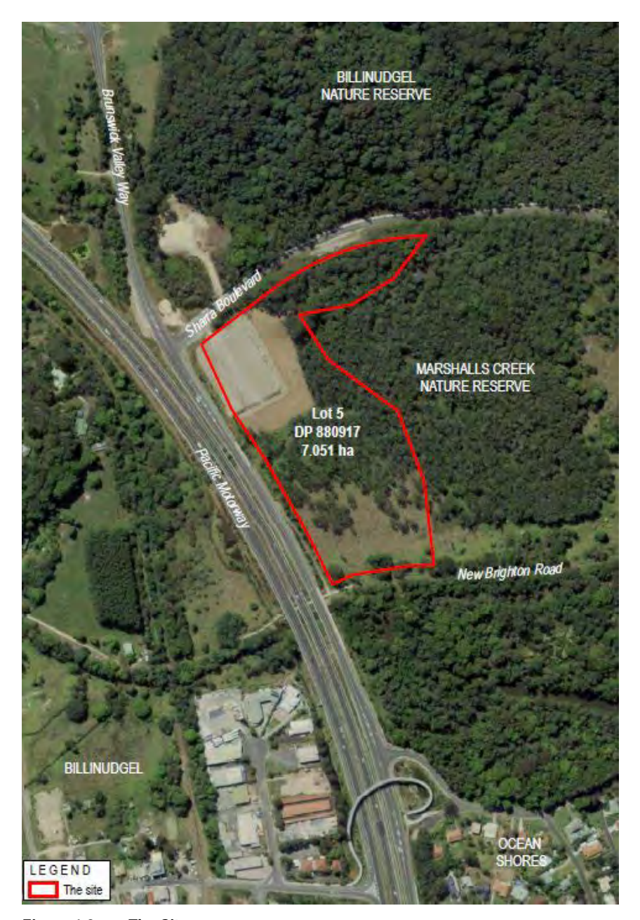
Figure 1.2 The Site