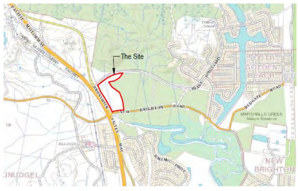
Figure 1.1 Location Plan

The location of the land is shown in Figure 1.1 below and on the Site Identification Maps in Appendix A .